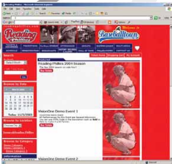
Branded with team image and colors