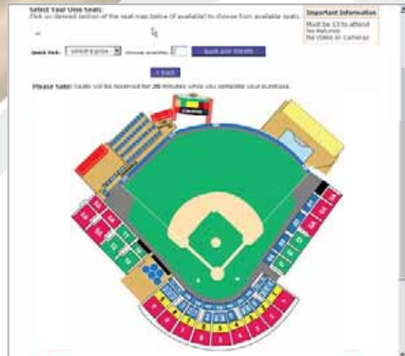
Interactive Seating Chart